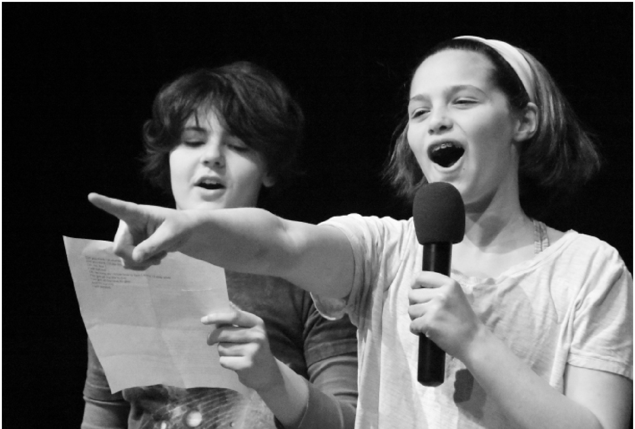
No Fear Friday, the Middle School open mic night, is led entirely by students