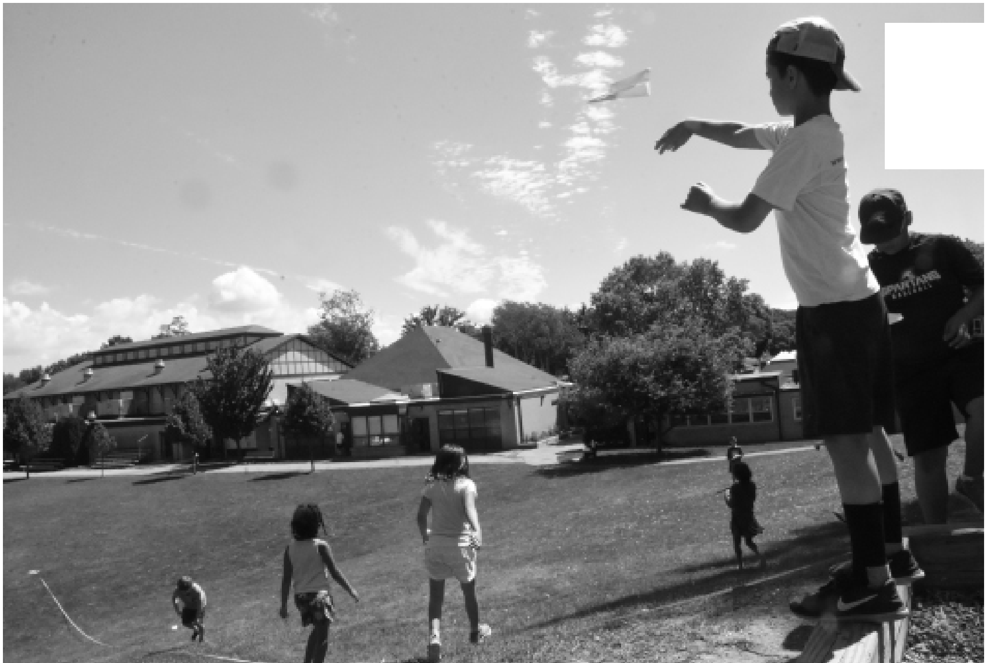
STEM sailing camp includes on-campus experiments in physics and aerodynamics