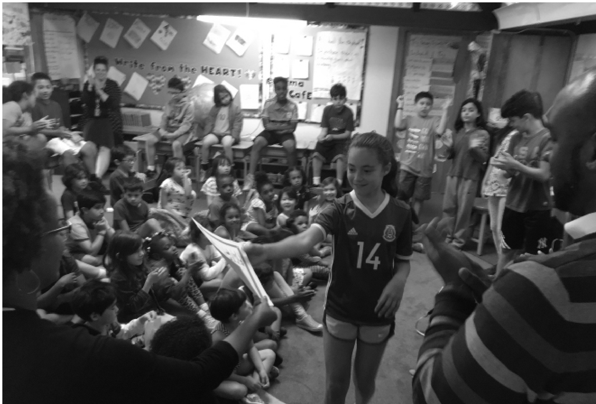
At the last Common Ground meeting of the year, fourth graders are honored by their peers before they move on to Middle School