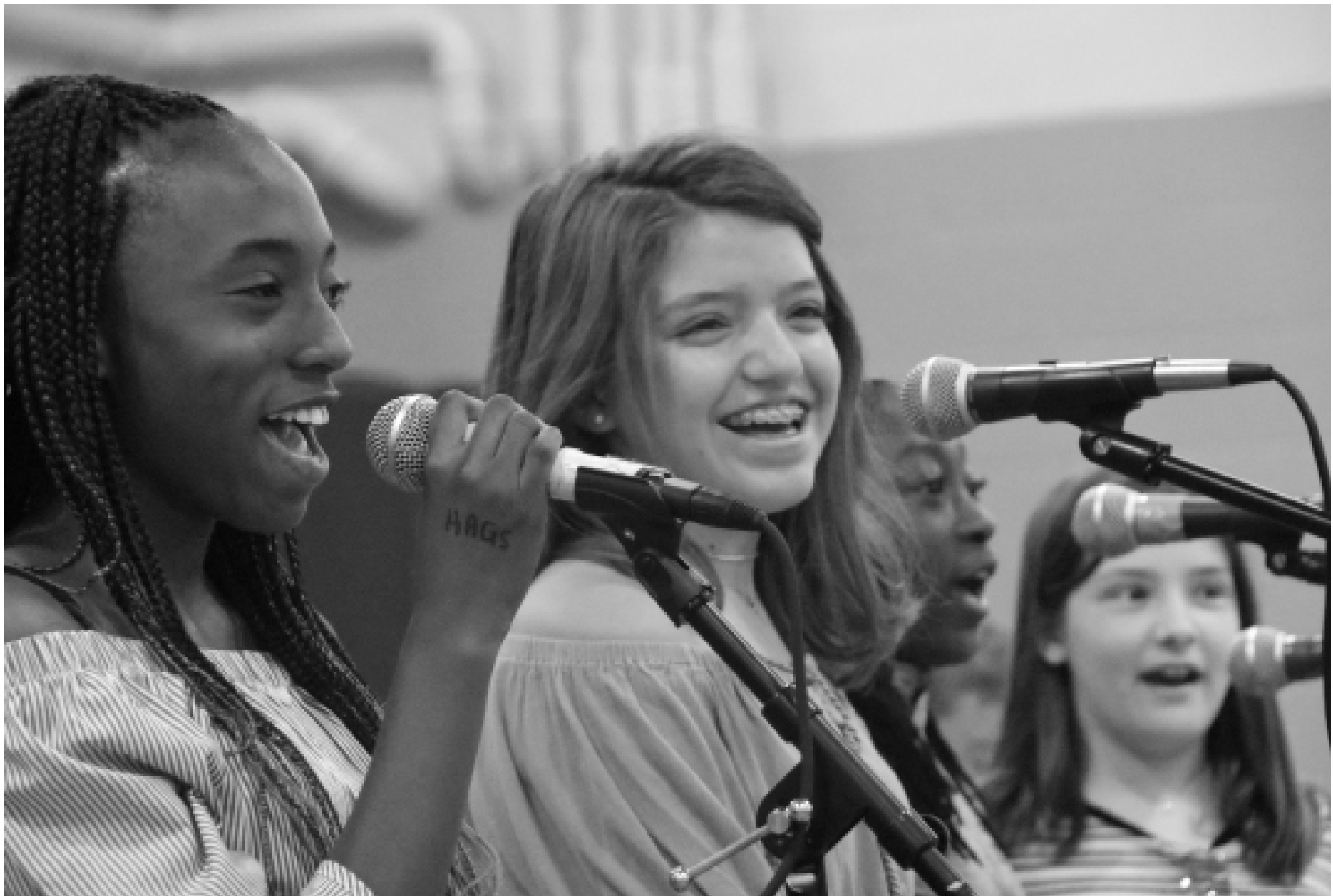
Seventh graders take center stage at the finale of the last assembly of the year